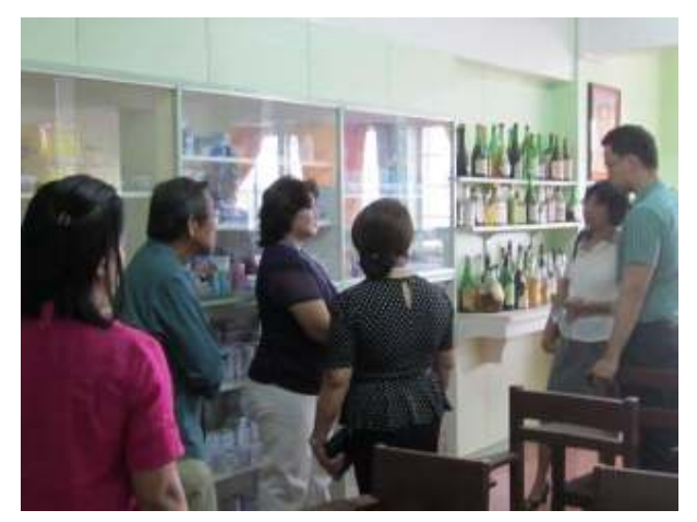
During the Tukals Lunas Visit at UIC.