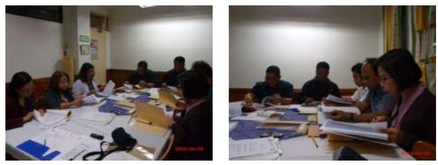
Members of the Ethics Review Committee and Research and Development Committee during the joint review of proposals.