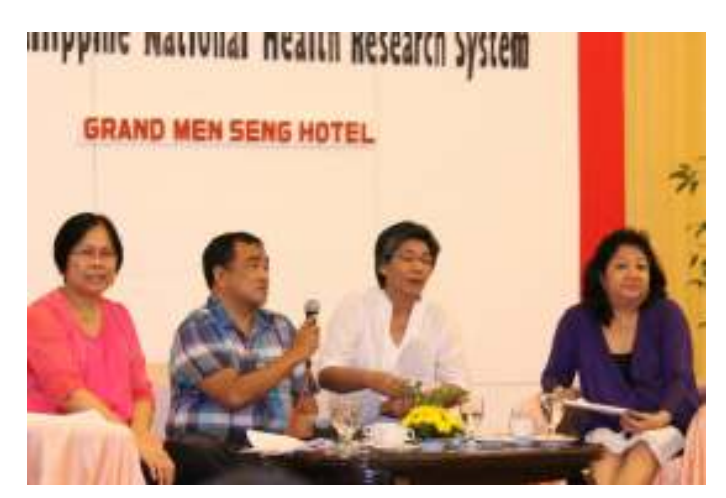
PNHRS Law Public Consultation Panel.

In lieu of the passage of the Republic Act 10530 or the Philippine National Health Research System Act of 2013, a public consultation for the crafting of the implementing rules and regulation of the aforementioned law was conducted. This was held last June 25, 2013 at the Monte Claire Ballroom, Grand Men Seng Hotel. The activity was spearheaded by the Philippine Council for Health Research and Development (PCHRD) and co-organized by the consortium. This was attended by 82 people coming from government agencies, hospitals, academe, media, private sectors and NGOs/civil organizations involved in health research. Through the conduct of the PNHRS Law Public Consultation, the audience was able to clarify major concerns regarding the RA 10530 including how the PNHRS Law could help in the dissemination of health researches and how it can protect the authors/ inventors (IPR).