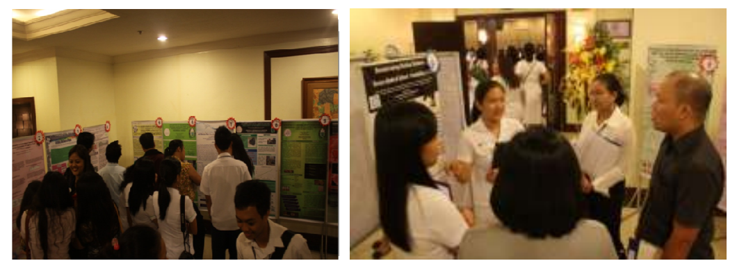
L to R : Students crowding the Poster Exhibit area and 3<sup>rd</sup> Health R&D Expo Poster Exhibit participants during the judges' critiquing.