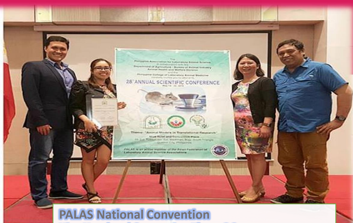
PALAS National Convention Hive Hotel and Convention Place, QC May 19-20, 2016

PALAS is duly recognized by the Department of Agriculture, Bureau of Animal Industry as an association that accredits animal facilities in the Philippines pursuant to Republic Act No. 8485 known as the "Animal Welfare Act of 1998".